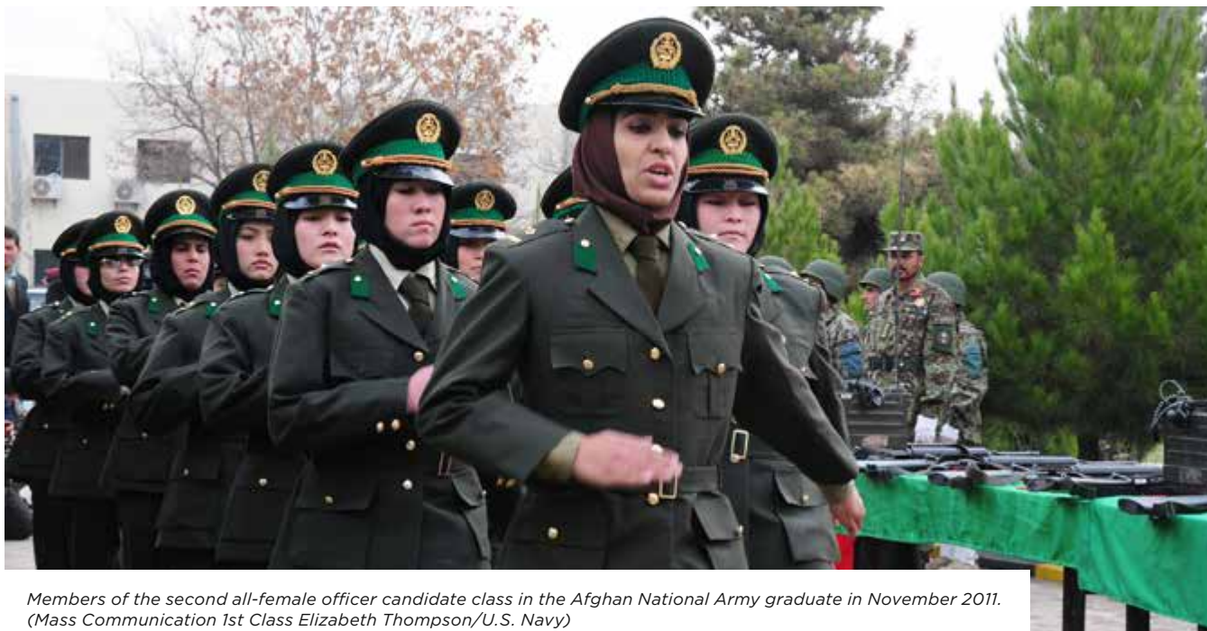
Members of the second all-female officer candidate class in the Afghan National Army graduate in November 2011.

of the Taliban insurgency in Afghanistan during those negotiations was probably not coincidental. The Obama administration sought to strengthen ties.