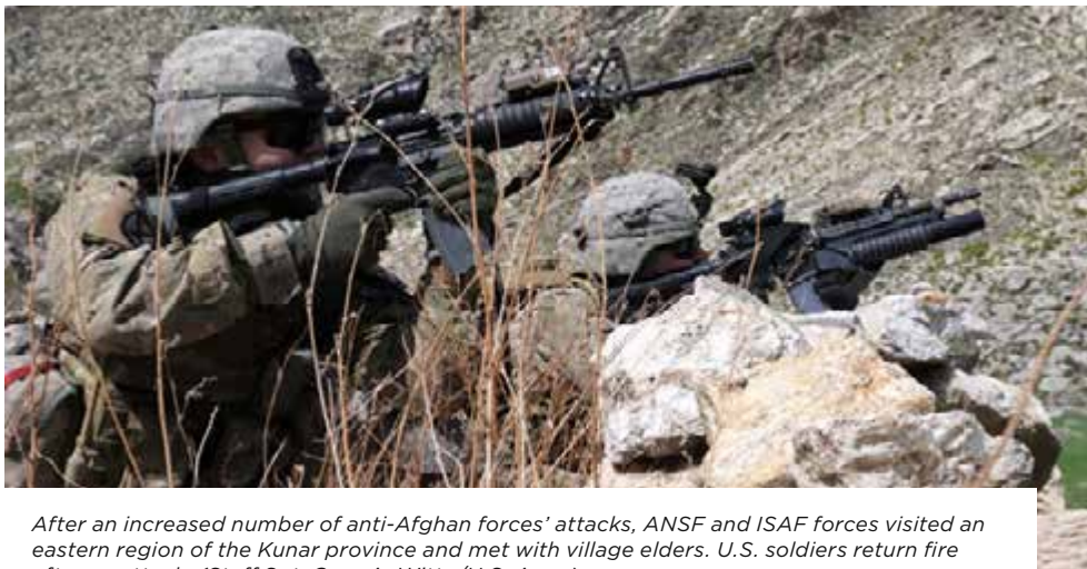
After an increased number of anti-Afghan forces' attacks, ANSF and ISAF forces visited an eastern region of the Kunar province and met with village elders. U.S. soldiers return fire after an attack.