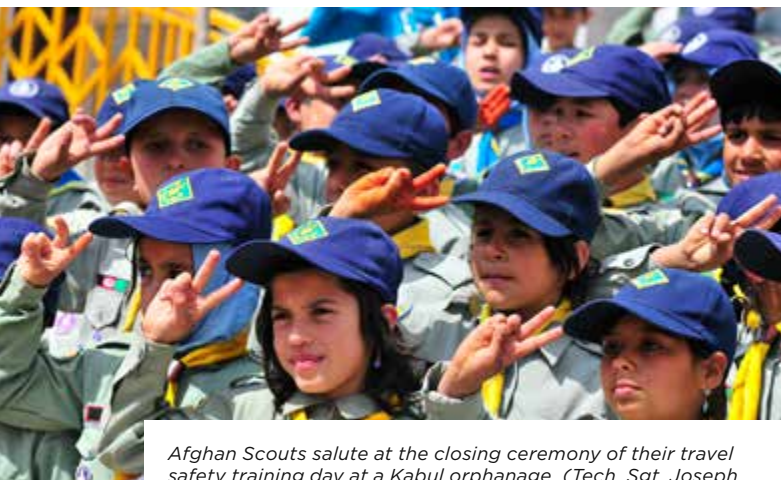
Afghan Scouts salute at the closing ceremony of their travel safety training day at a Kabul orphanage.

At current levels of support, the ANDSF can prevent the overthrow of Afghan government and prevent