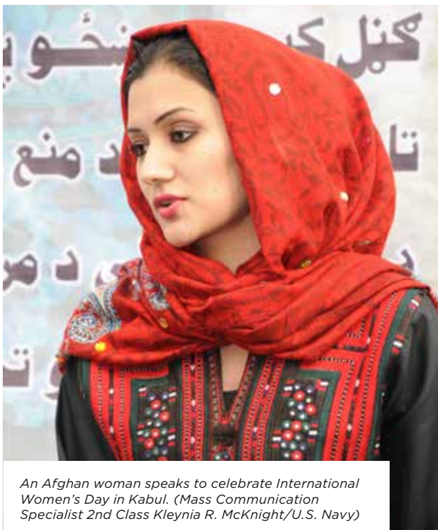
An Afghan woman speaks to celebrate International Women’s Day in Kabul.

This report is organized in two main parts. Part I offers an overview of the Afghanistan situation, posits three strategic options, and recommends a new way forward. Part II delves deeper into the state of play in Afghanistan and the region, explores the potential reactions to the new strategy, assesses the risks to success, and offers ways to address them.