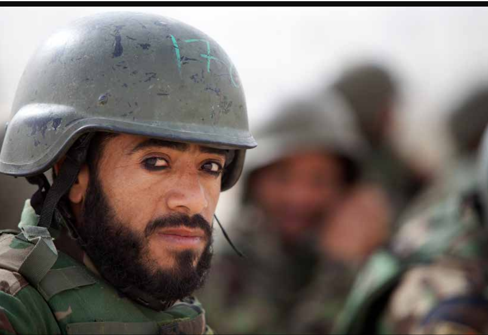
An Afghan National Army soldier participates in a live-fire training at Camp Shorabak in Helmand province in April 2013.