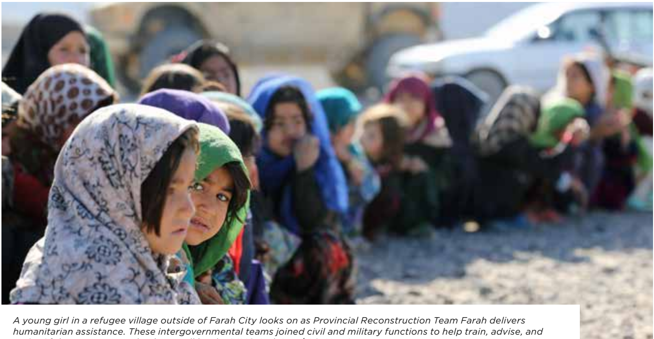
A young girl in a refugee village outside of Farah City looks on as Provincial Reconstruction Team Farah delivers humanitarian assistance. These intergovernmental teams joined civil and military functions to help train, advise, and assist Afghan government leaders at all levels.

militant groups that threaten its neighbors. Such penalties could include suspending major non-NATO ally status, designation as a state impeding counterterrorism efforts, suspension of security assistance, targeted actions against specific individuals and organizations for supporting militant groups, discouraging future IMF bailouts, and designation as state sponsor of terrorism.*