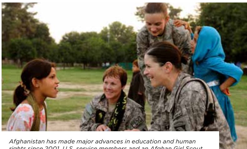
Afghanistan has made major advances in education and human rights since 2001. U.S. service members and an Afghan Girl Scout speak Pashto together in August 2010.

The most realistic prospect for a favorable and durable outcome is a gradual peace process that respects the dignity and sacrifices of Americans and Afghans and prevents the return of terror safe-havens. To bring this about, America needs a more focused approach.