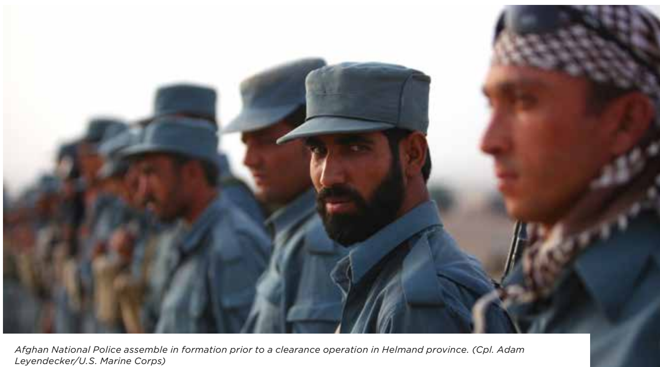
Afghan National Police assemble in formation prior to a clearance operation in Helmand province.

Education has been a bright spot in Afghanistan's development. In 2001, roughly 800,000 children were in school – nearly all of them boys. As of 2016, approximately 8 million children are enrolled in school – a third of them girls. It is one of the greatest advances in education in modern history. Still, Afghanistan experiences significant problems with student and teacher absenteeism. The Special Inspector General for Afghan Reconstruction (SIGAR), a U.S. government watchdog, has questioned the enrollment numbers. 90 Corruption in the education sector, like elsewhere in government,