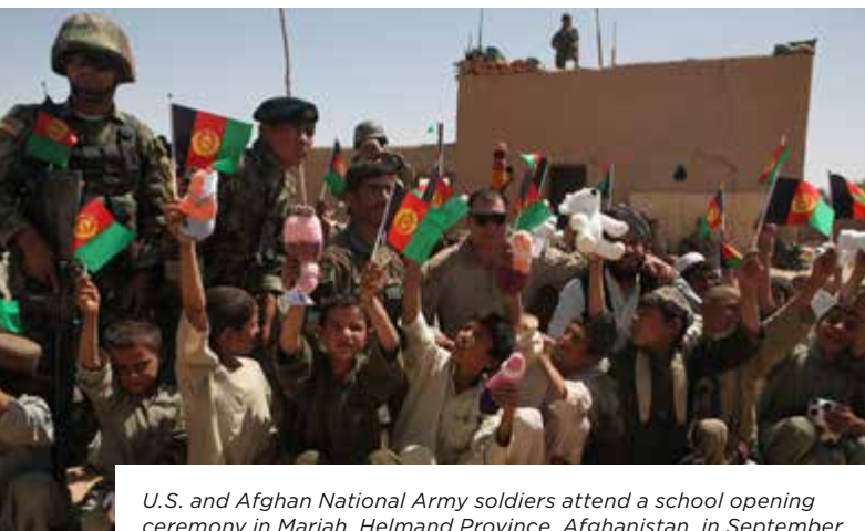
U.S. and Afghan National Army soldiers attend a school opening ceremony in Marjah, Helmand Province, Afghanistan, in September 2011.

Option B ( Status quo ) maintains current support levels for Afghanistan and centralized management from Washington, but heightens the risk of expensive failure. This approach retains tight levels of White House control, but limited bandwidth and other global crises probably will keep pushing Afghanistan to the back burner. The result of such micromanagement has been limited engagement on matters such as political reform, a peace process, and regional diplomacy – and often poor integration of U.S. efforts. Washington simply cannot keep pace with such a dynamic conflict. This approach will prevent the near-term collapse of the Afghan government but traps the United States in an expensive and indefinite commitment while critical strategic threats remain inadequately addressed.