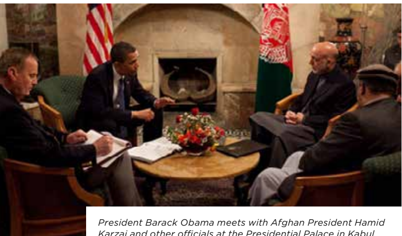
President Barack Obama meets with Afghan President Hamid Karzai and other officials at the Presidential Palace in Kabul during his first presidential visit to the region in March 2010.

Taliban from securing major population centers. 109 The ANDSF are steadily losing ground in the countryside, however. 110 Afghan Special Operations Forces continue to perform very well, but are over-utilized. Leadership at ministerial levels remains weak and often corrupt, which has a trickle-down effect in the army and police. Military officials in Afghanistan observe that general-purpose army forces in the 201, 203, and (to a lesser degree) 205 Corps have performed relatively better than their counterparts in the 207, 209, and 215 Corps. 111 Part of the reason may be the 12-month-long partnering and advising relationships from U.S. Army units since 2009 for the first three corps. The latter have enjoyed only six-month relationships from non-U.S. Army units. The most extreme problems to date have been in the 215 Corps in Helmand, which had no advisors in 2015. The corps nearly collapsed due to poor leadership, incompetence, and corruption. It had to be reconstituted and retrained over the winter. RS has pulled forces from other units to give the 215th a permanent cadre of advisors.